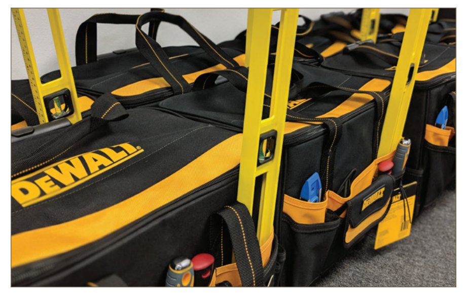
Stocked toolboxes ready for apprentices.

In developing the DAP, we instead looked outside the museum field—and outside the United States—for inspiration. In countries like Switzerland and Germany, the apprenticeship model is well-integrated as a key workforce-development strategy.<sup>7</sup> Although the apprenticeship model has not been institutionalized in the United States at the levels seen in Europe, there has more recently been renewed interest. Starting with the Obama administration, there has been greater investment in apprenticeships.<sup>8</sup> According to the U.S. Department of Labor, apprenticeships have grown by 56 percent since 2013.<sup>9</sup> In 2018 alone, the data show that "238,000 individuals nationwide entered the apprenticeship system."<sup>10</sup>