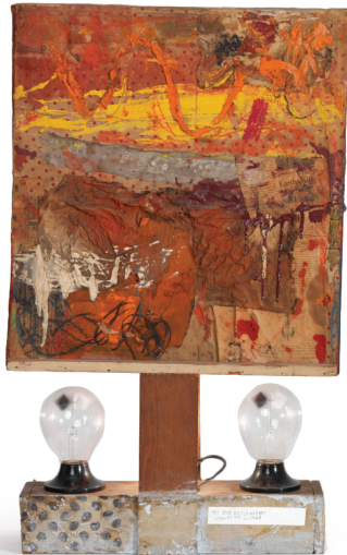
Robert Rauschenberg, Untitled , ca. 1954. Combine: Oil, fabric, newspaper and charcoal collage with light bulb and two Crookes radiometers on wood structure. 25 1/4 x 15 1/2 x 3 3/4 inches (64.1 x 39.4 x 9.5 cm). © Robert Rauschenberg Foundation / VAGA at ARS, NY. RRF Registration #54.024